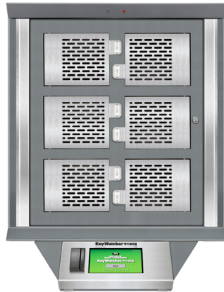
Single Locker Module