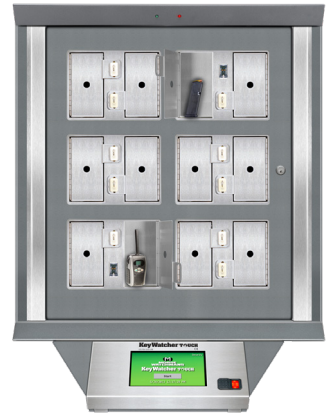
Dual Locker Modules